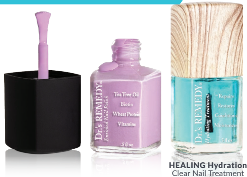
HEALING Hydration Clear Nail Treatment